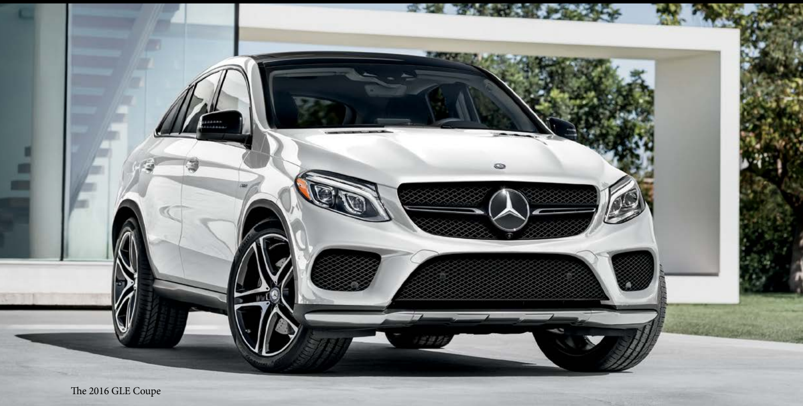
The 2016 GLE Coupe