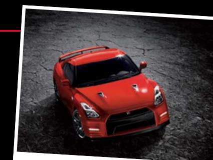
2016 Nissan GT-R