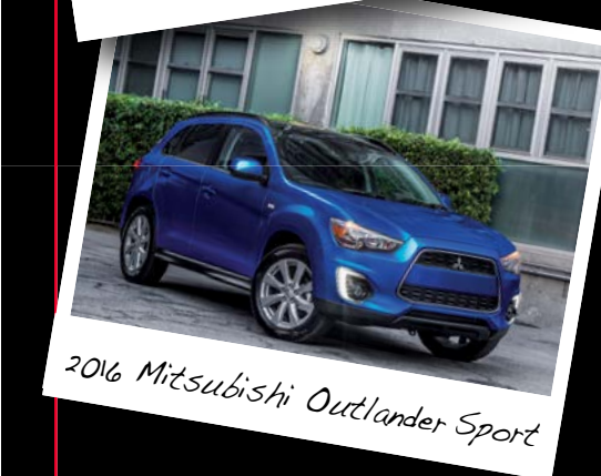
2016 Mitsubishi Outlander Sport