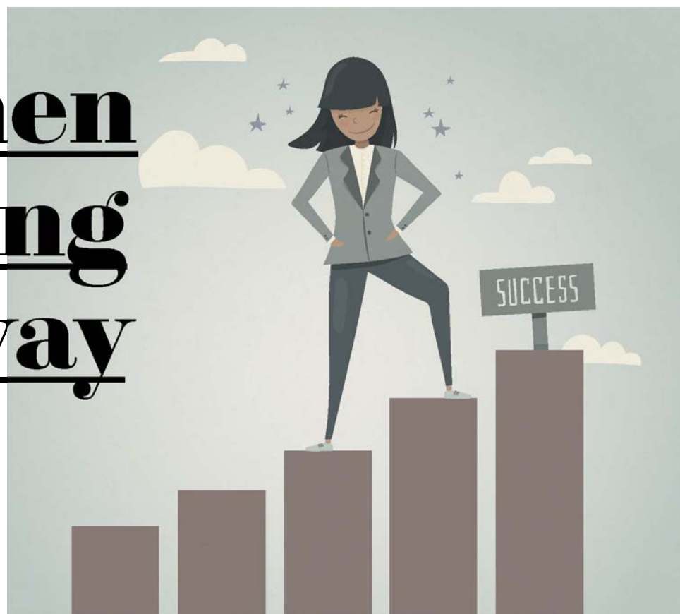
Illustration designed by Freepik