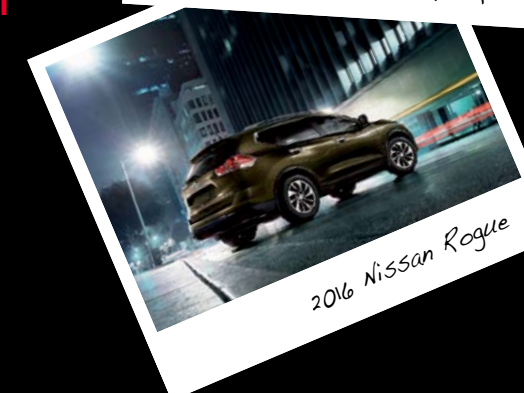
2016 Nissan Rogue