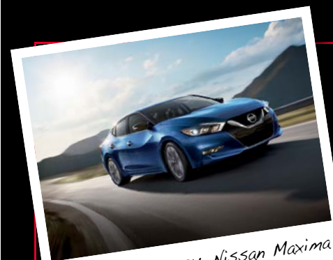
2016 Nissan Maxima

An independent, college preparatory, co-ed, Episcopal day school serving a community of students grades 6-12.