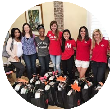
Done in a Day Thanksgiving baskets project, November 19, 2016