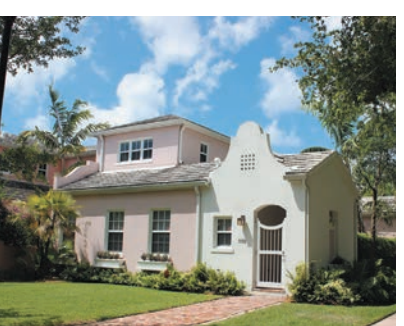
SPECIALIZING IN RESIDENTIAL REAL ESTATE IN CORAL GABLES, COCONUT GROVE, PINECREST, SOUTH MIAMI, AND ENVIRONS