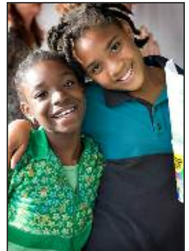
Step Up to the Plate