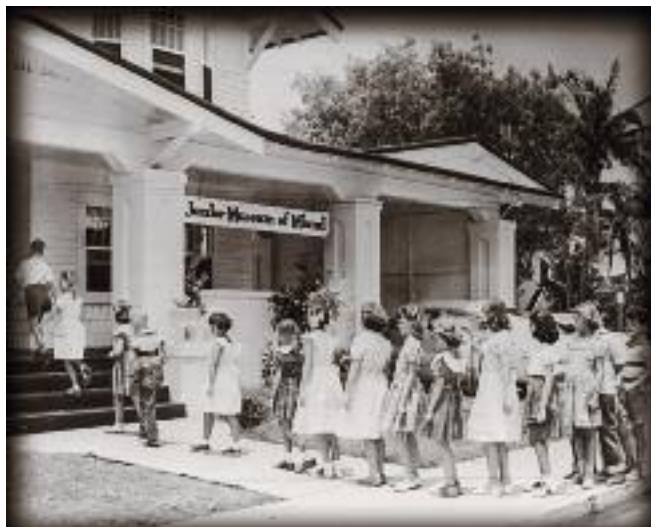
Original Junior Museum – from Tropical Topics / JLM archives

its doors in 1950 in a house on Biscayne Boulevard and 26th Street. More than 2,000 children visited the museum during the first three months of operation. By the fourth month, average monthly attendance was 2,000. A larger facility was needed to accommodate the increasing