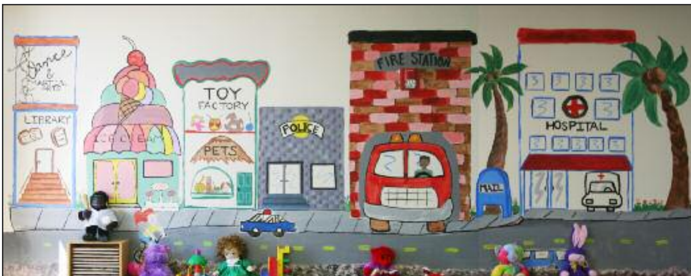
Provisionals show that the "gloves are off" by painting this mural for Kristi House, the Children's Advocacy Center for Miami-Dade for sexually abused children. Kristi House is also one of JLM's grant recipients.