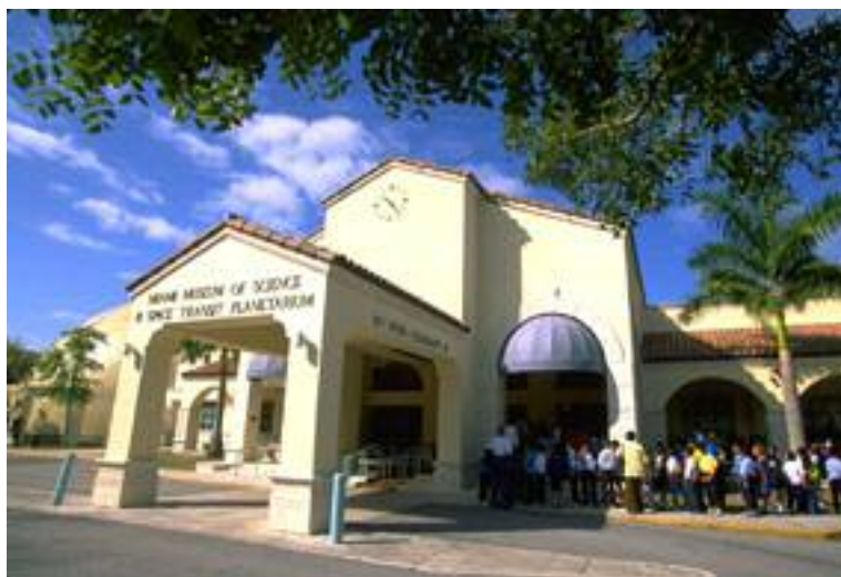
Current Museum