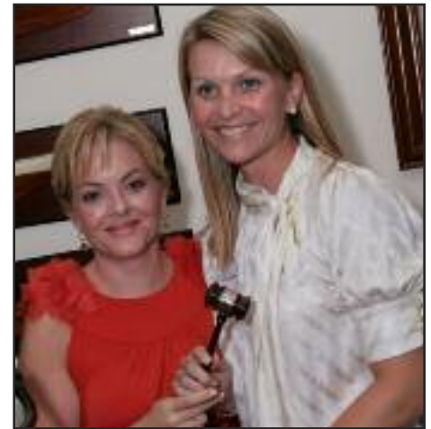
The passing of the presidential gavel at the JLM Annual Meeting.

There are so many needs within the League. Even with 350 active volunteers,