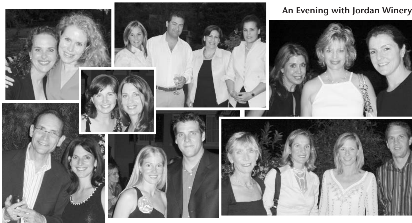
An Evening with Jordan Winery